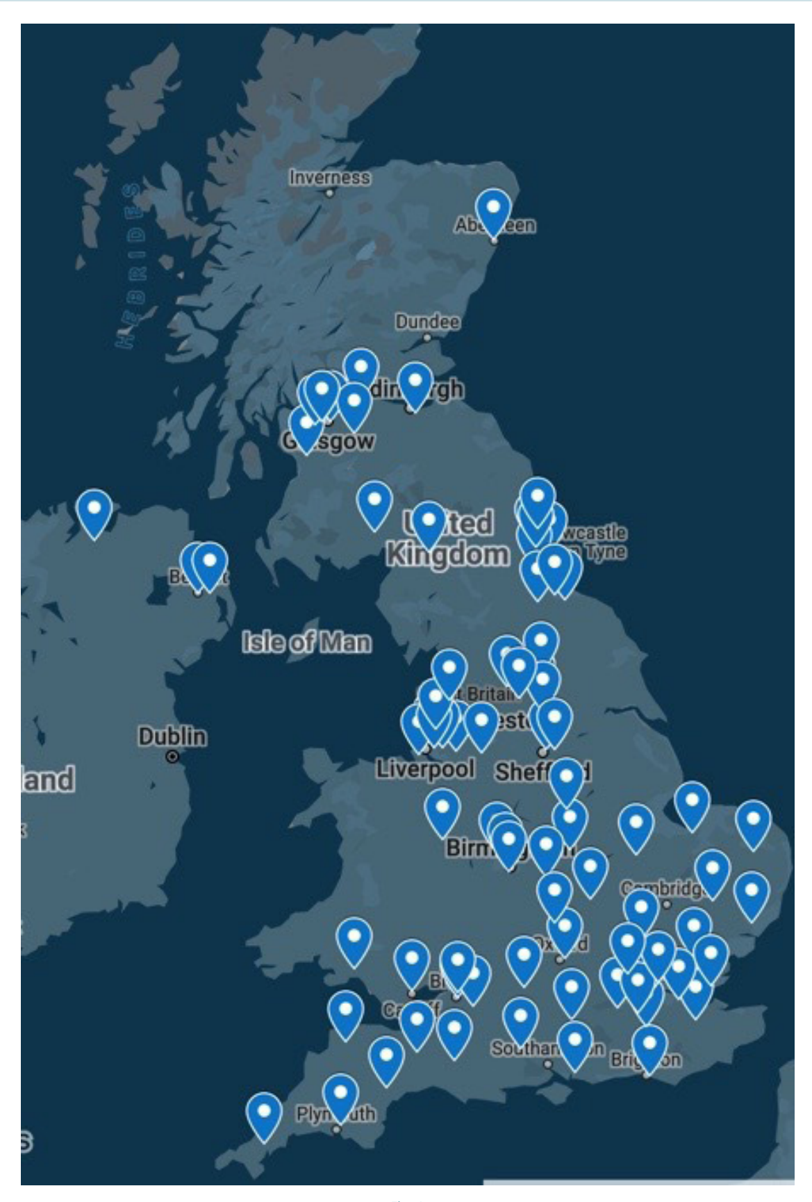
Fig. 1 Distribution of enrolled sites.