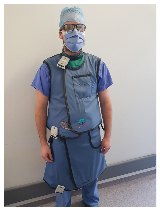
Fig. 1 Position of electronic personal dosimeters during standing procedures.

Fig. 2 Position of electronic personal dosimeter (EPD) 2 during seated procedures. Lead skirt placed over EPD.