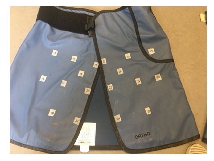
Fig. 4 Position of thermoluminescent dosimeters on lead skirt.

Radiation protection equipment in orthopaedic trauma theatre adequately reduced radiation exposure to surgeons to below recommended thresholds. This study quantifies the radiation dose to operator's torso, eyes, and lower limbs for individual surgical procedures. This study sought primarily to identify if current protective devices are adequate, and if there were any gaps in protection, particularly for situations where the operator is seated. It also assesses if there are certain aspects of orthopaedic surgery or if there are certain procedures that have higher exposure. Finally, it demonstrates the usefulness of EPDs in providing real-time measurement of radiation exposure for individual cases in orthopaedics.