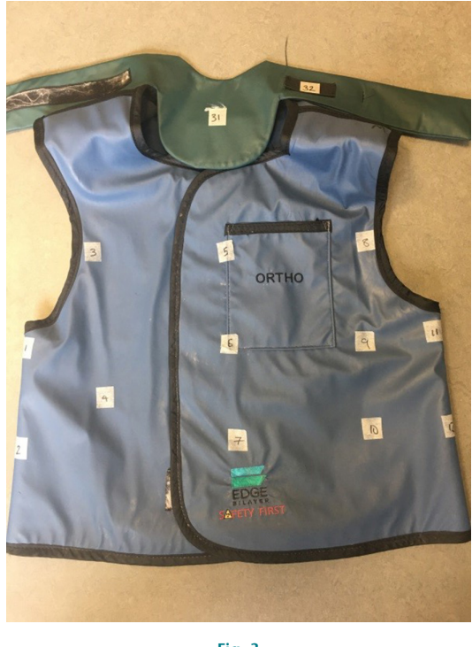
Fig. 3 Position of thermoluminescent dosimeters on lead apron.