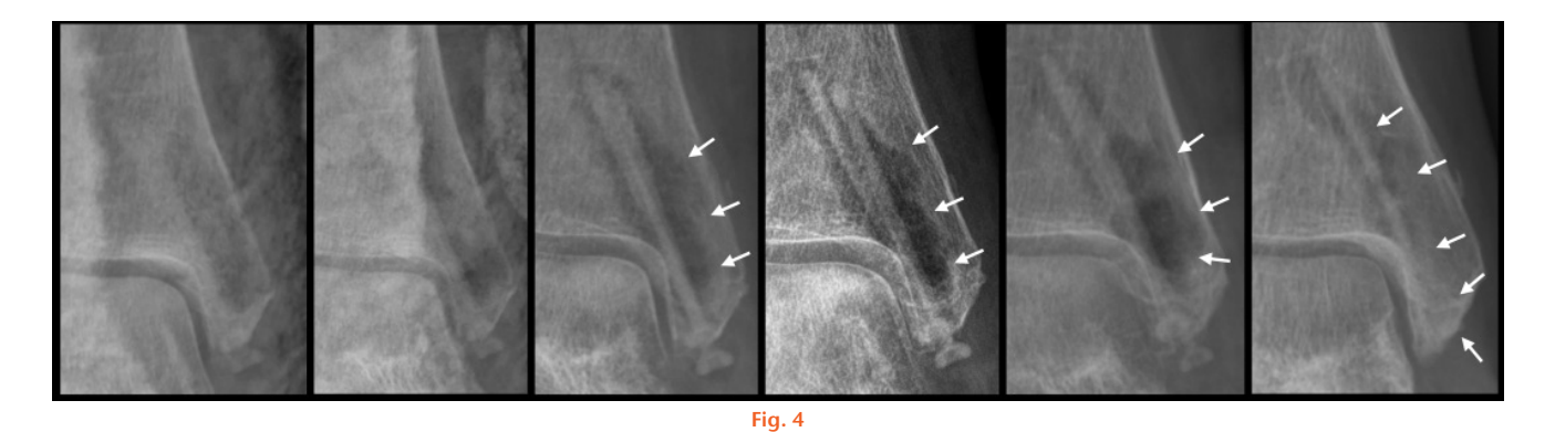
Anteroposterior ankle radiographs of a 61-year-old female patient with pre-existing osteoporosis, bimalleolar fracture with a posterior malleolar fragment. From left to right, anteroposterior ankle radiograph after surgery, after two weeks (reduction of the fractures with two magnesium (Mg)-based screws and a titanium plate and screws), after six weeks (obvious radiolucent zones fracture consolidation), after 12 weeks (steady radiolucency, small sclerotic line at the border of the radiolucent zone to the surrounding tissue), after 24 weeks, and after 52 weeks (steady sclerotic line, increase in density at former radiolucent area). The white arrows show the gas formation arround the screw.

a) Anteroposterior and lateral ankle radiographs of a 49-year-old female patient; medial malleolar fracture combined with distal tibiofibular joint disruption (Maisonneuve fracture). b) Two-week timepoint radiographs, anatomical reduction with two magnesium (Mg)-based screws and one titanium screw; visible fracture line at the medial malleolus, small signs of radiolucent zones within the bone surrounding the screws. c) Six-week timepoint, plane radiographs with complete fracture consolidation, increase of radiolucent zones within the bone surrounding the screws, removed titanium screw. d) Timepoint radiograph images at 12 weeks with constant radiolucent zones. e) Timepoint radiographs at 24 weeks. f) CT scan at 52 weeks, decrease of radiolucent zones, increased endosteal bone mass, and periosteal bone ingrowth at the screw head (white arrow).