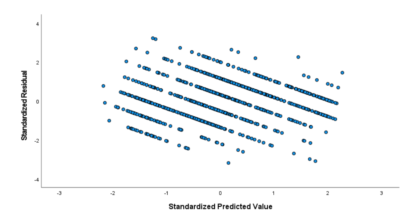
Fig b. Scatter plots of standardized predicted values versus standardized residual values for homoscedasticity.